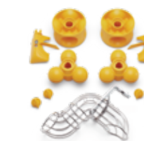
Kit S Squeezing Kit (45 - 67 mm)