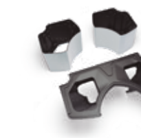
Countertop Kit Orange Silver Graphite