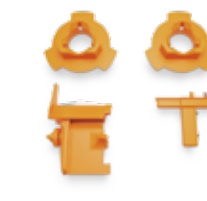
Dynamic Cutting System DCS