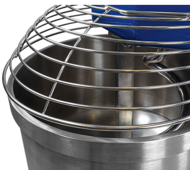
Stainless steel safety guard

A simple, robust and reliable machine designed to ensure optimum performance.