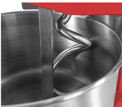
High resistance stainless steel bowl, spiral arm and breaking bar.