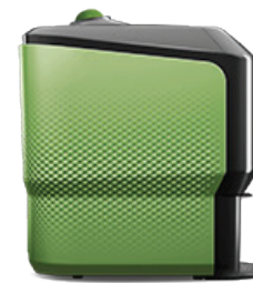
LIGHT GREEN (Especially designed for Limes)