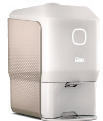
WHITE NATURAL SAND