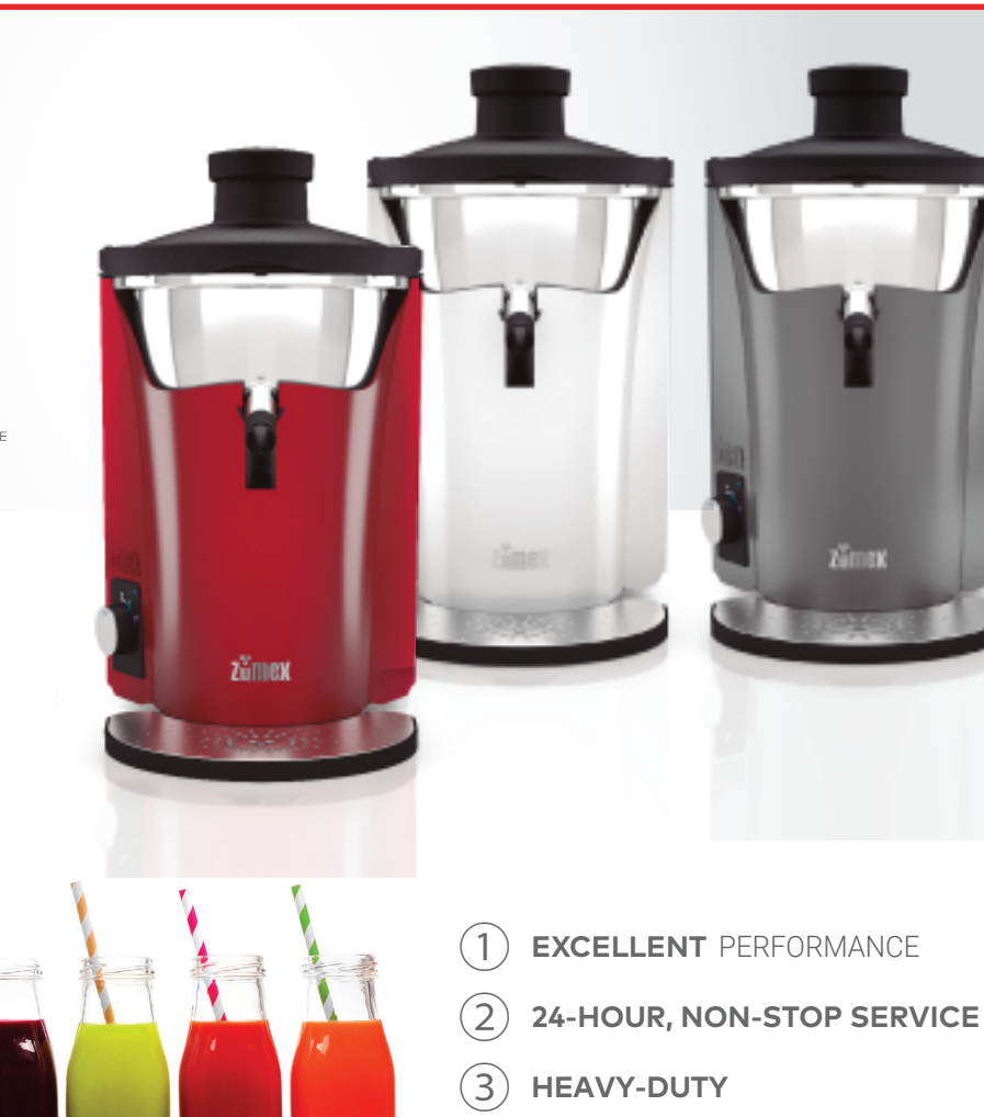
High-capacity built-in waste bucket (13 litres)