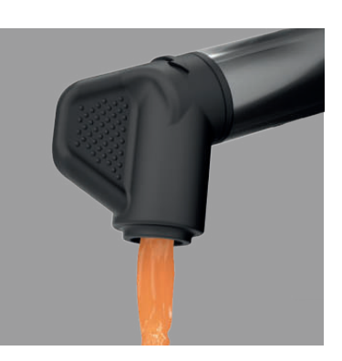
A more hygienic tap with an improved grip and optimal flow.

Maximum shredding power and sharper cutting for longer for all fruit and vegetables